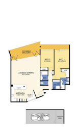
583 PARKYN PARADE MOOLOOLABA