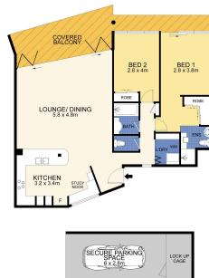
583 PARKYN PARADE MOOLOOLABA

INTERNAL AREA - 88 SQM PARKING AREA - 31 SQM TOTAL AREA - 119 SQM